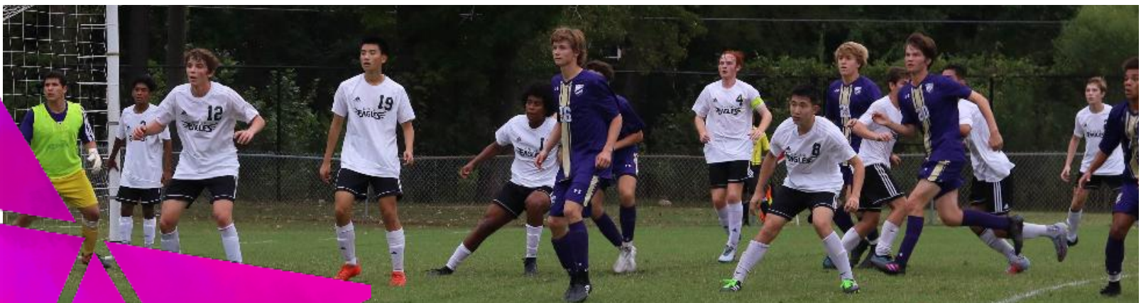
48 By: Courtney Eash